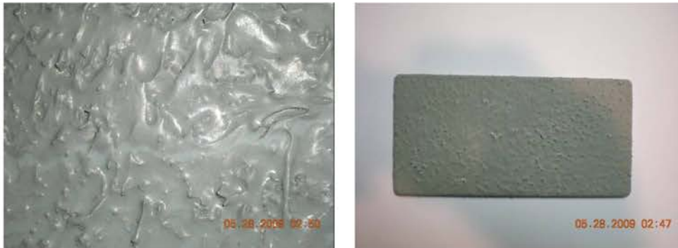
Figure 2. (Left Photo) Surface of MC-156 coated panel following 3500 hours in 5% salt solution. (Right Photo) MC-156 coated Luminore panel following 5000 exposure to 5% salt solution.

The MC-156 topcoat was successful in preventing corrosion of the surface. The topcoat remained glossy and clear without any signs of corrosion on the substrate up to 3500 hours (left photograph in Figure 2). Past this point, localized areas of low luster began to appear. At 5000 hours the surface was determined to be “failed.” The “failed” surface had low gloss and appeared more “chalky” when compared to other test samples (right photograph in Figure 2).